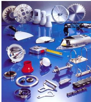
Cold rolled strip consumption in Germany (in %, estimated)